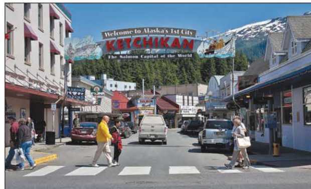
Ketchikan welcomes visitors to what it says is “The Salmon Capital of the World.”

And on shore? Thousands of disappointed travelers standing in line when they’d expected to see eagles, orcas and sea otters. Precious vacation time spent waiting for tour buses and queuing up to pay for souvenirs. Towering 3,000-passenger ships so big calling at ports so small that the sidewalks feel like Times Square. Floating hotels so huge that Alaska is little more than scenery for onboard cooking demonstrations, yoga classes, floor shows and wellness seminars.