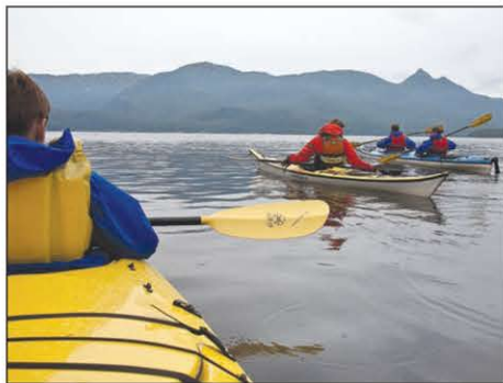
Kayakers explore the coves in the Tongass Narrows, Ketchikan, on Revillagigedo Island, Alaska.

“They can hear banging and engine noises. High-pitched whines, too. If there were five or six ships here they might swim away. But we’re the only ship with the time to stay and watch.”