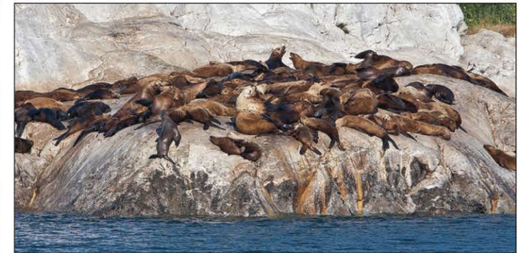
Steller sea lions rest on rocks at an islet in Glacier Bay as seen from the Sea Bird of Lindblad Expeditions Alaska.

Cruise West’s fleet used to sail these routes. But the company is gone now, folded in September 2010. Fortunately, five of its expedition-style ships still